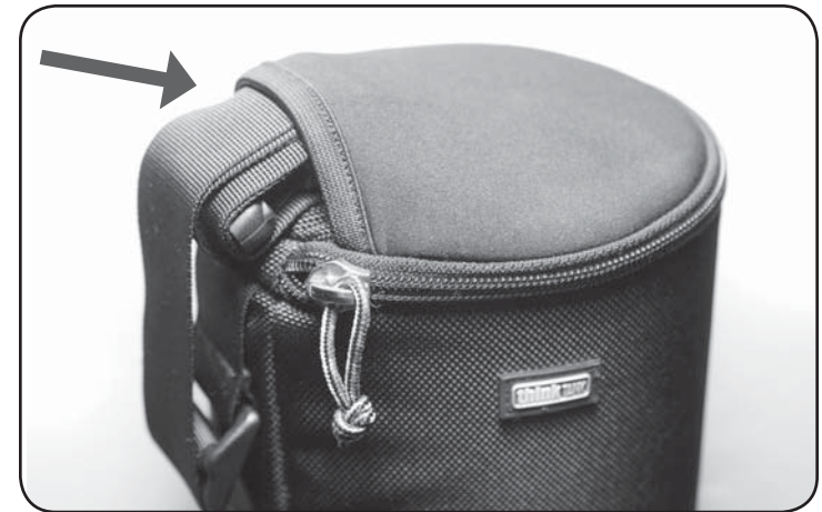
Top of Bazooka

To extend or retract the Bazooka Tripod Case, lift up on adjustment buckle while pulling up or down on the lower portion of the Bazooka Tripod Case.