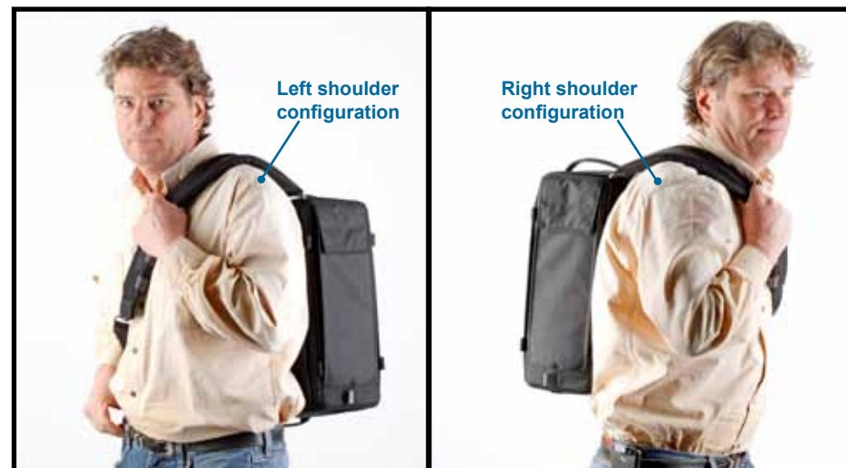
3. Sling-O-Matic 20