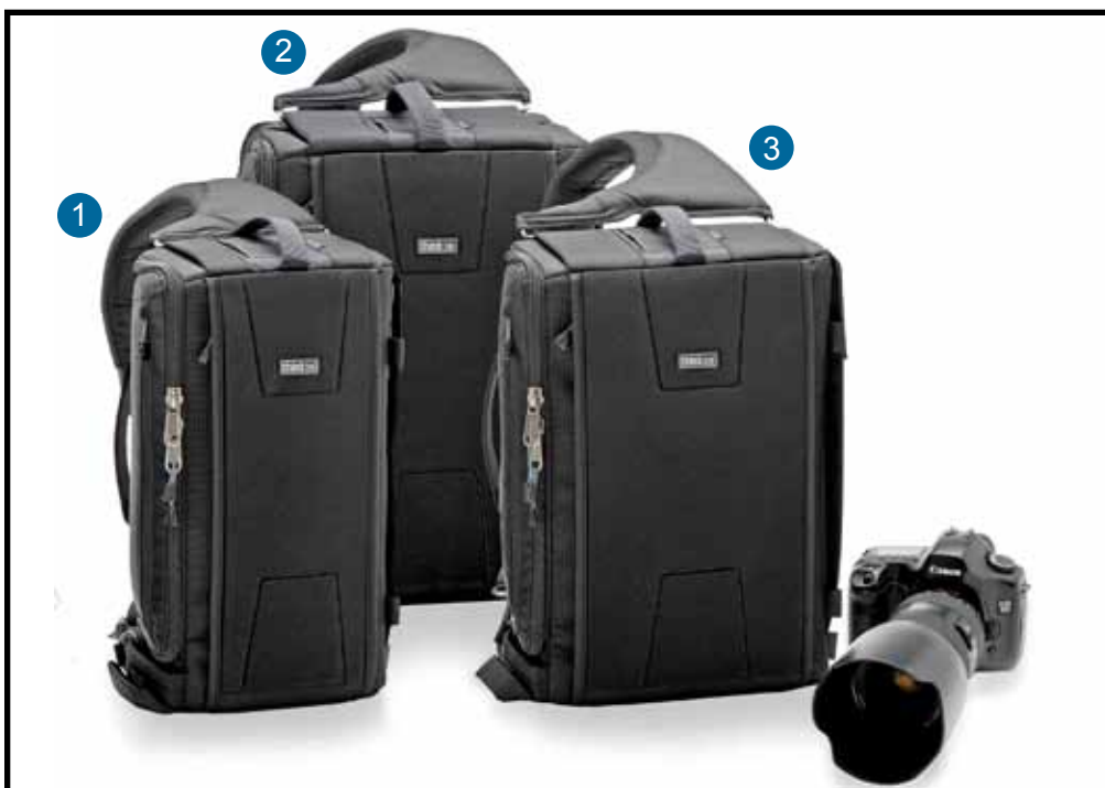
1. Sling-O-Matic 10